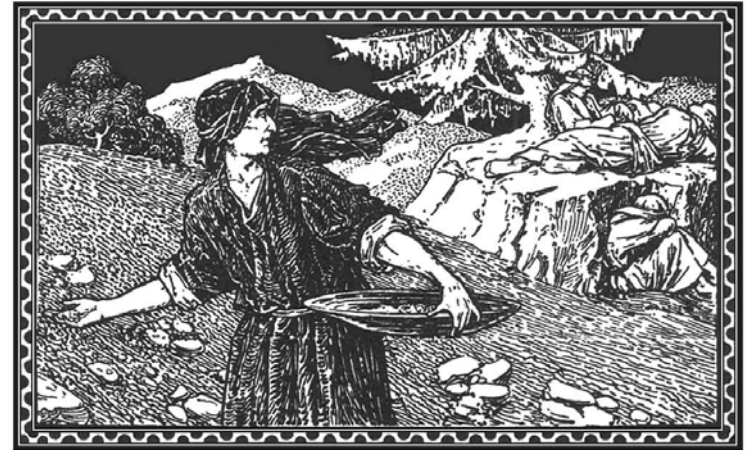
While men were asleep, his enemy came and oversowed cockle among the wheat.