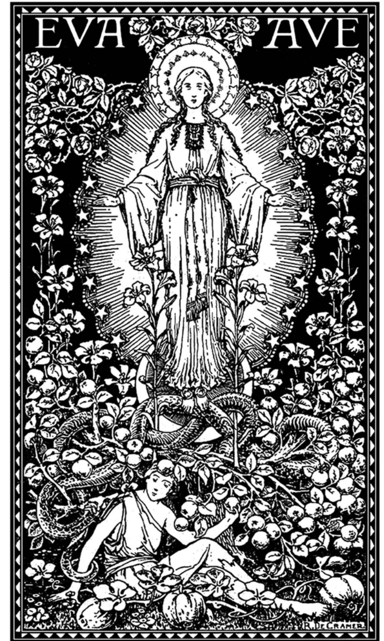
The Immaculate Conception